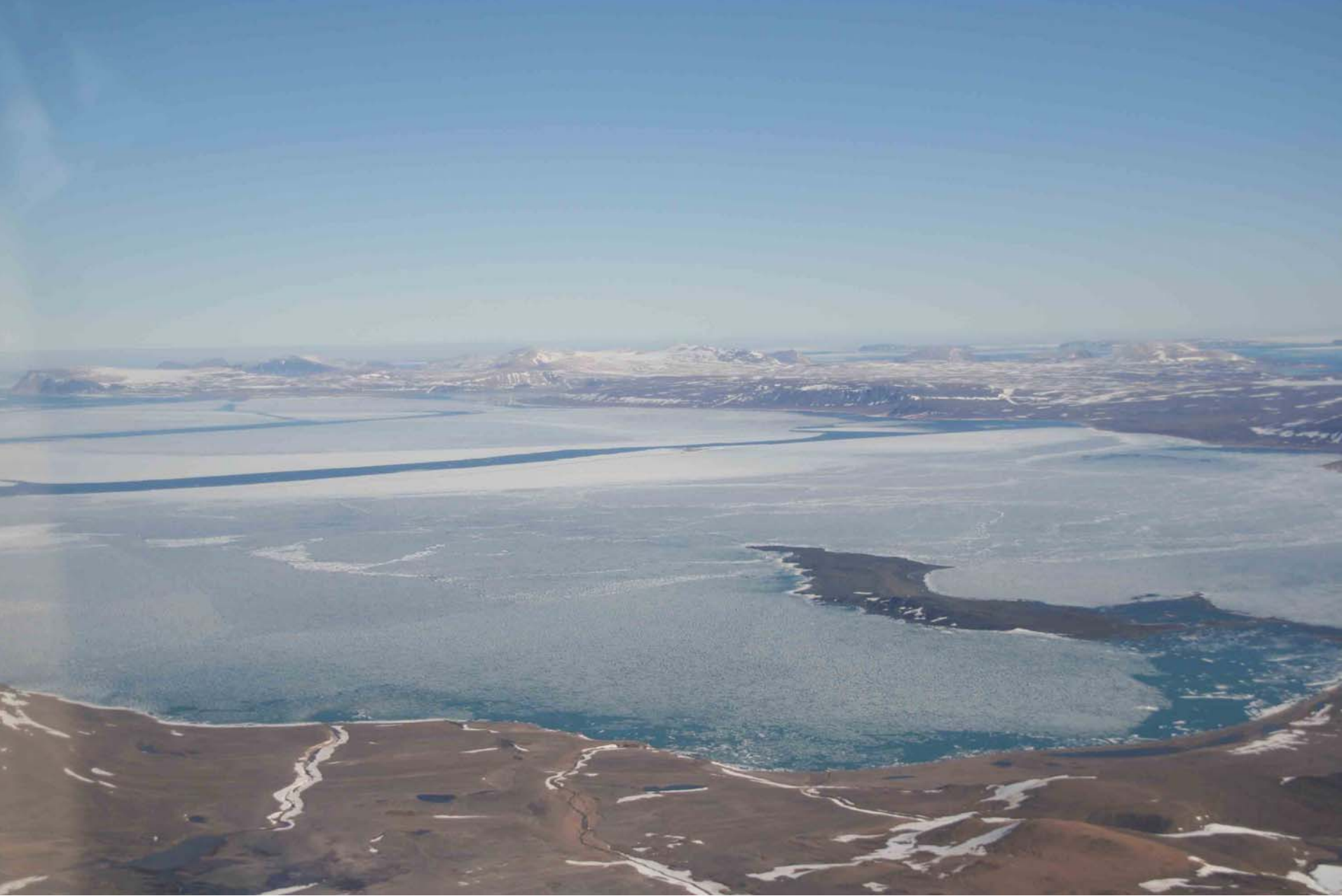
Rijpfjorden towards northeast 7 July 2007