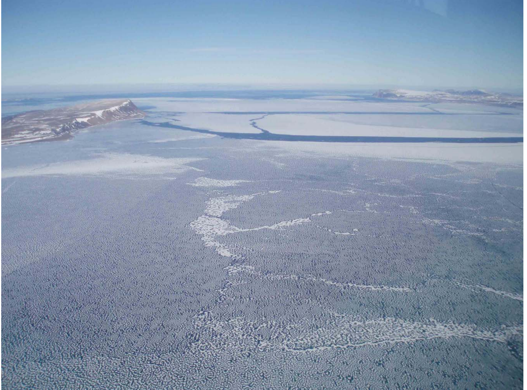
View northwards 7 July 2007; Kap Loven to the left