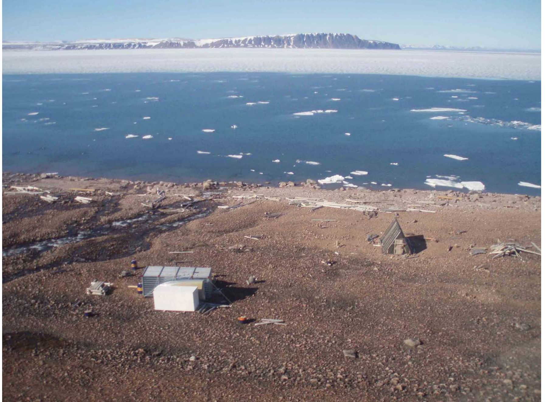
Camp and Kap Loven transect 7 July 2007