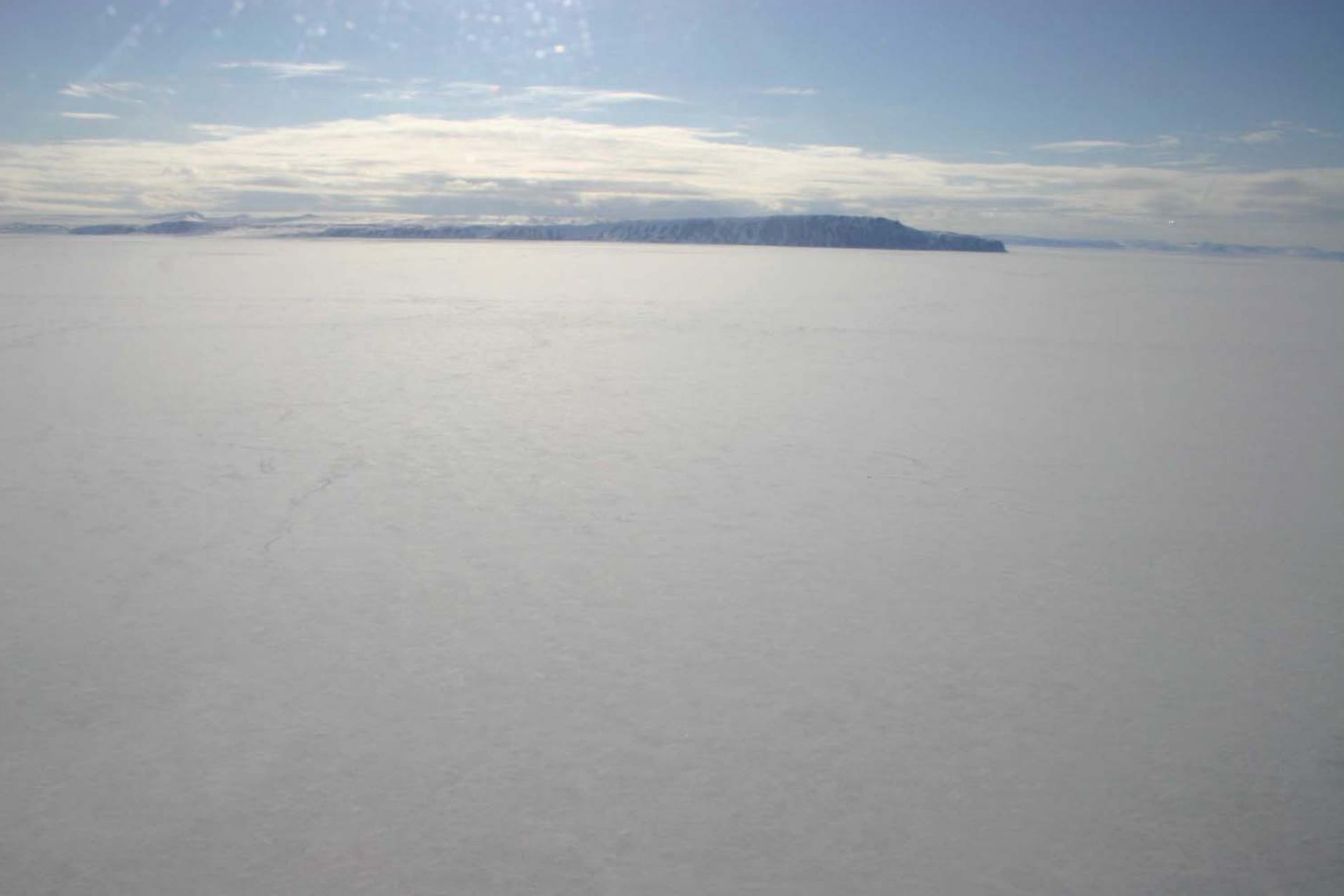
View towards Kap Loven from helicopter 10 June 2007