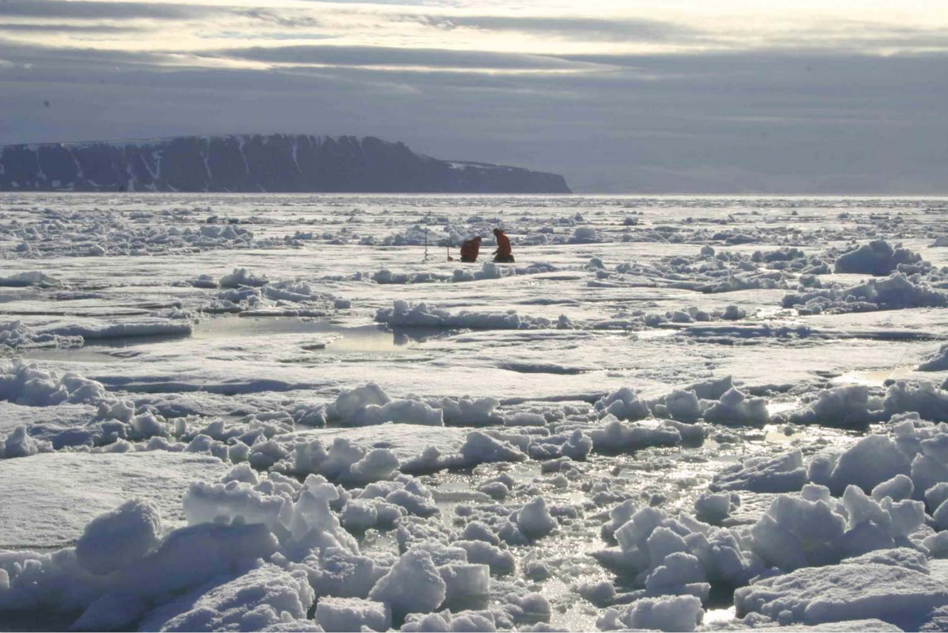
Kap Loven transect 9 July 2007