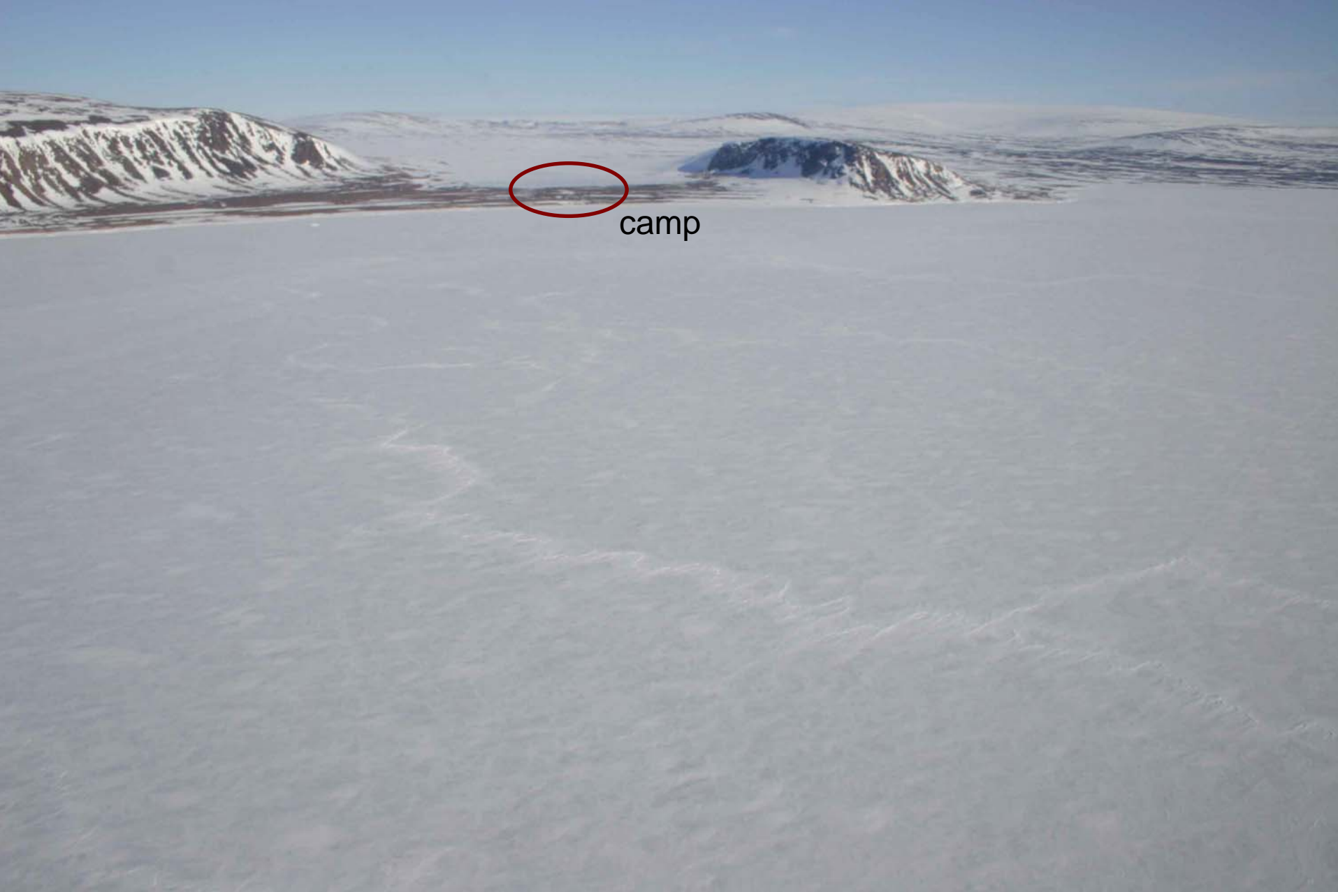
View eastwards from the helicopter 10 June 2007