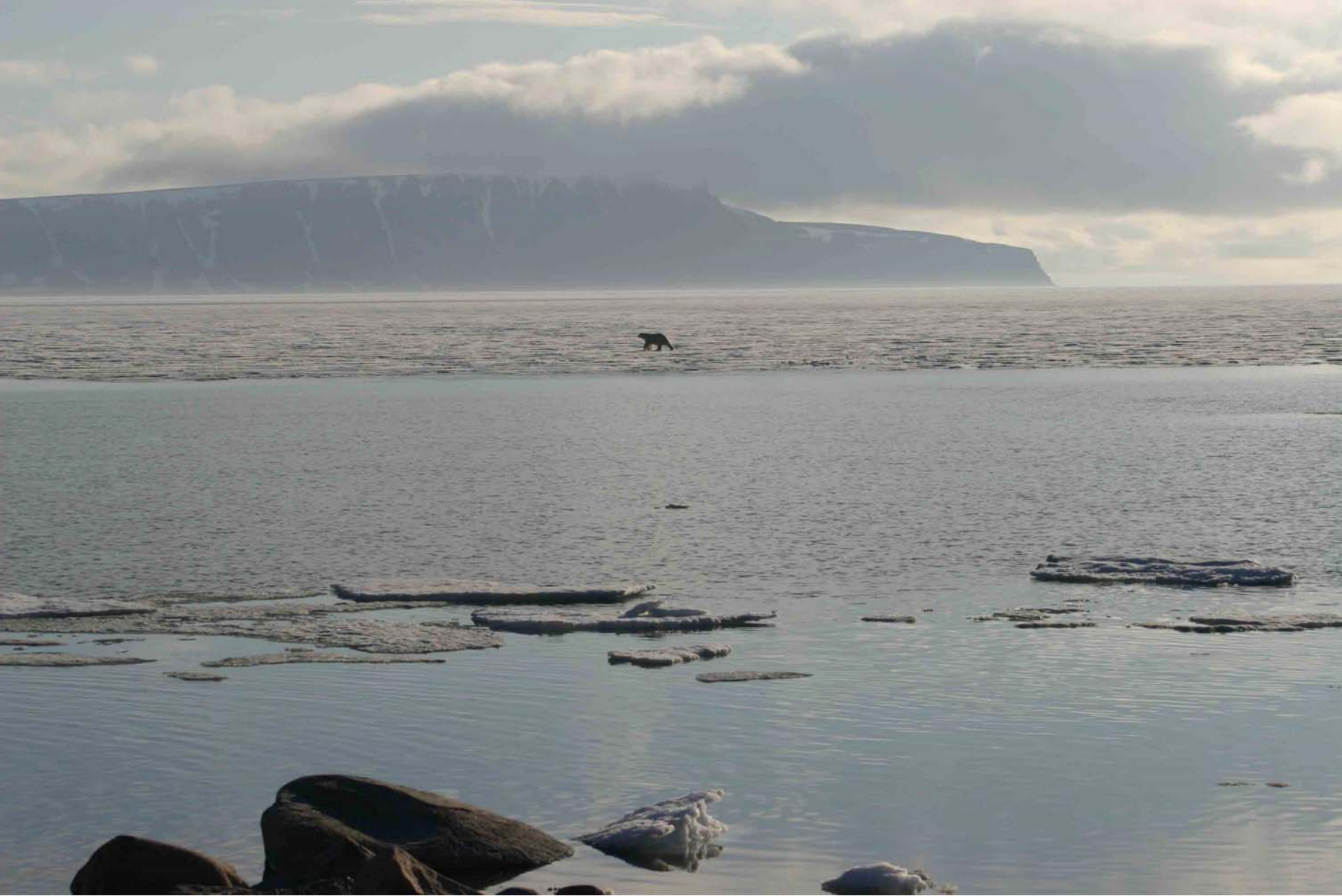
Kap Loven transect 8 July 2007