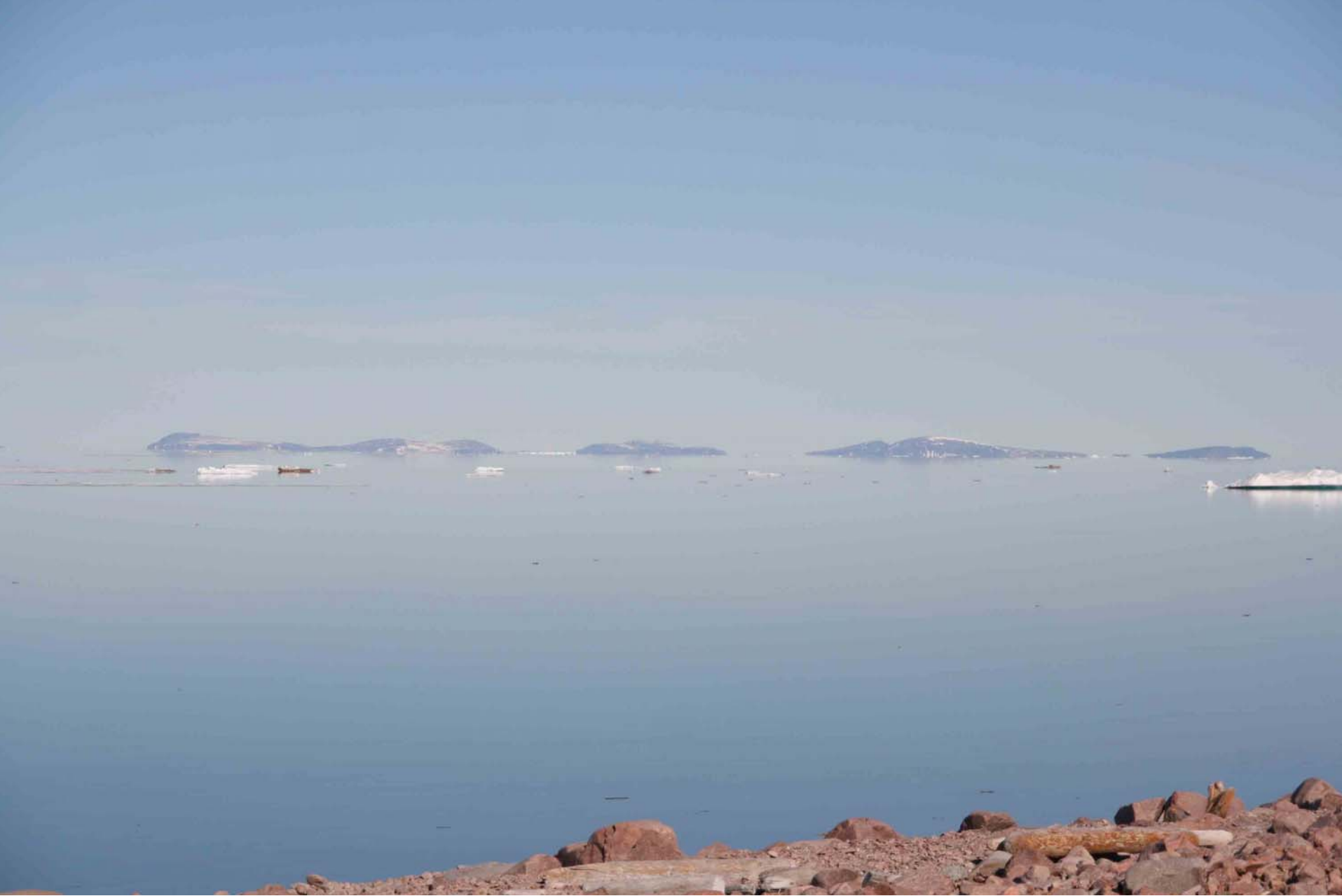
View northwards towards Sjuøyane, 15 July 2007