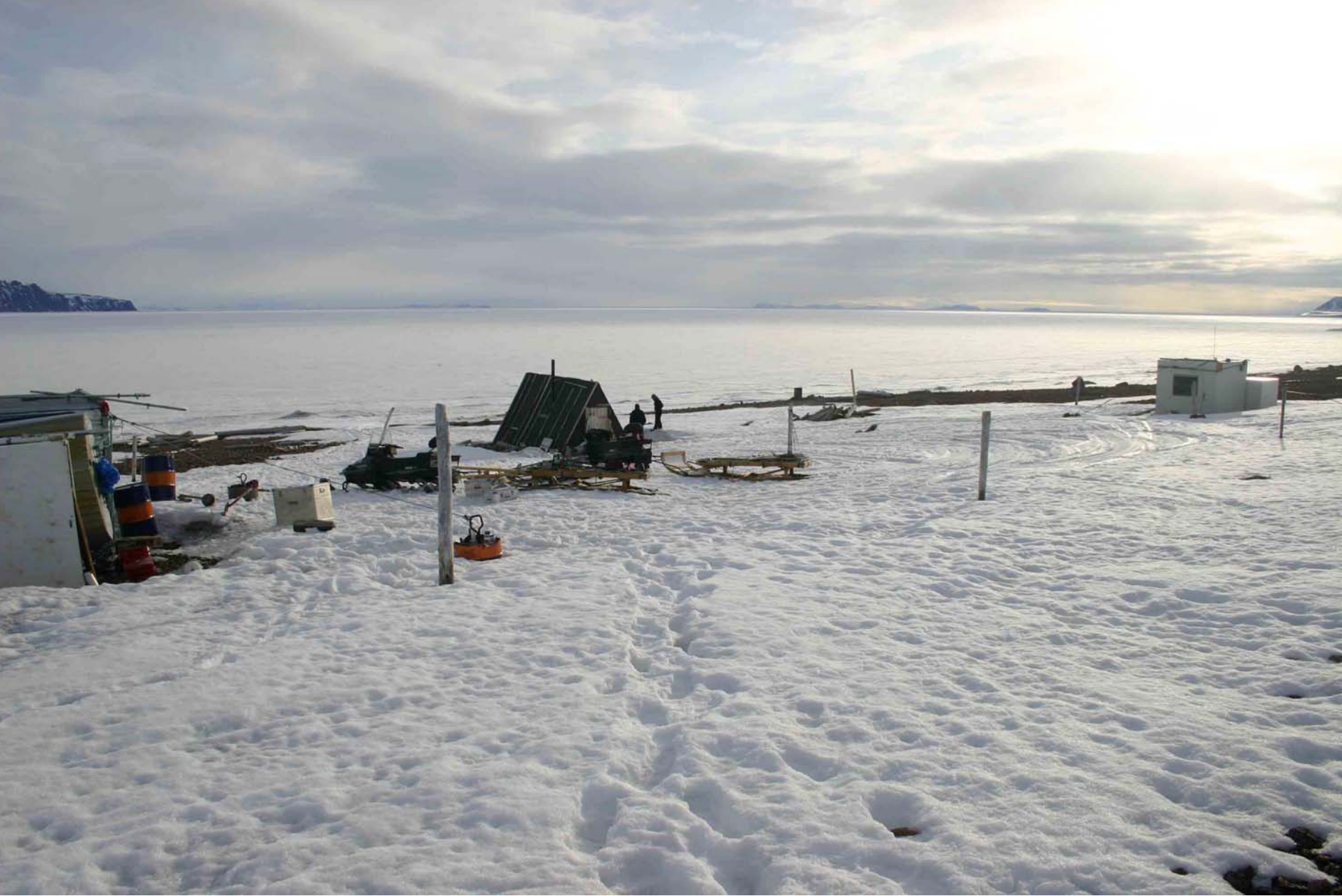
Beginning of June: View northwards towards Sjuøyane (Kap Loven to the left)