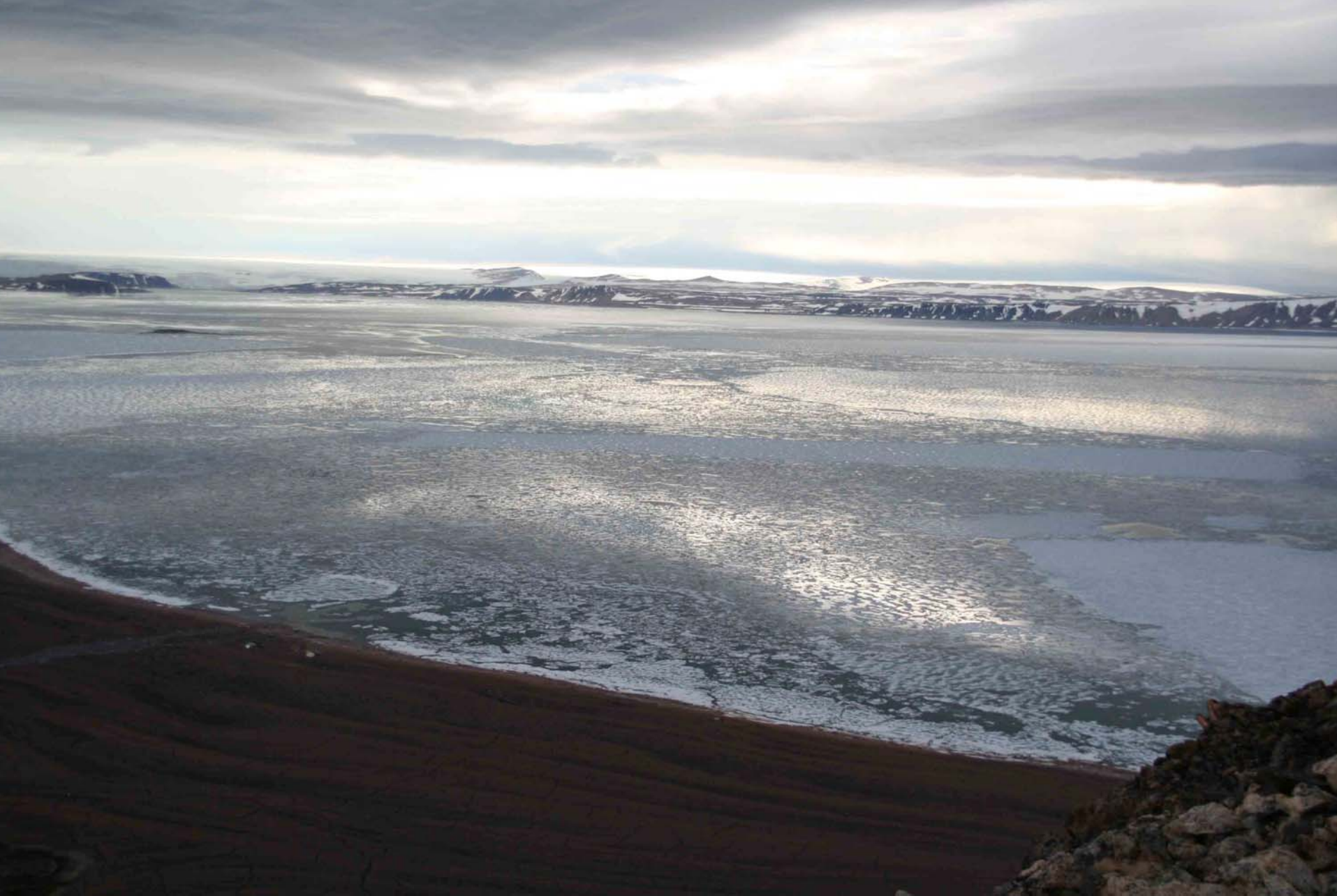
View towards west 10 July 2007, camp to the left in the foreground